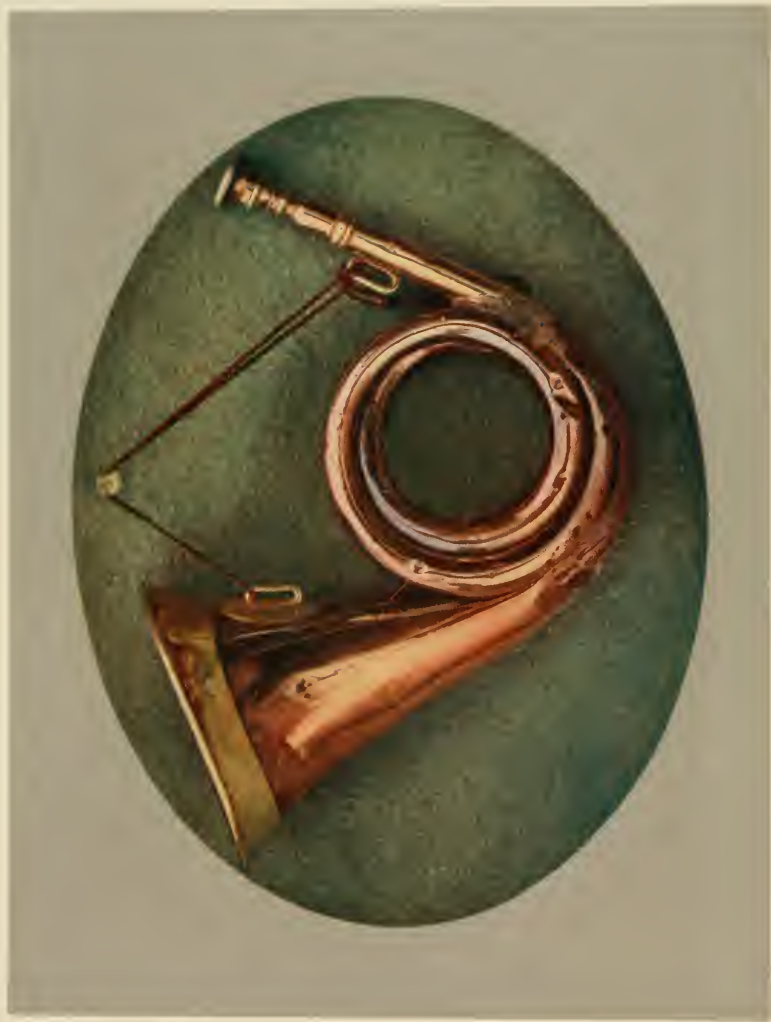
GEORGE TEMPLER'S OLD HORN.